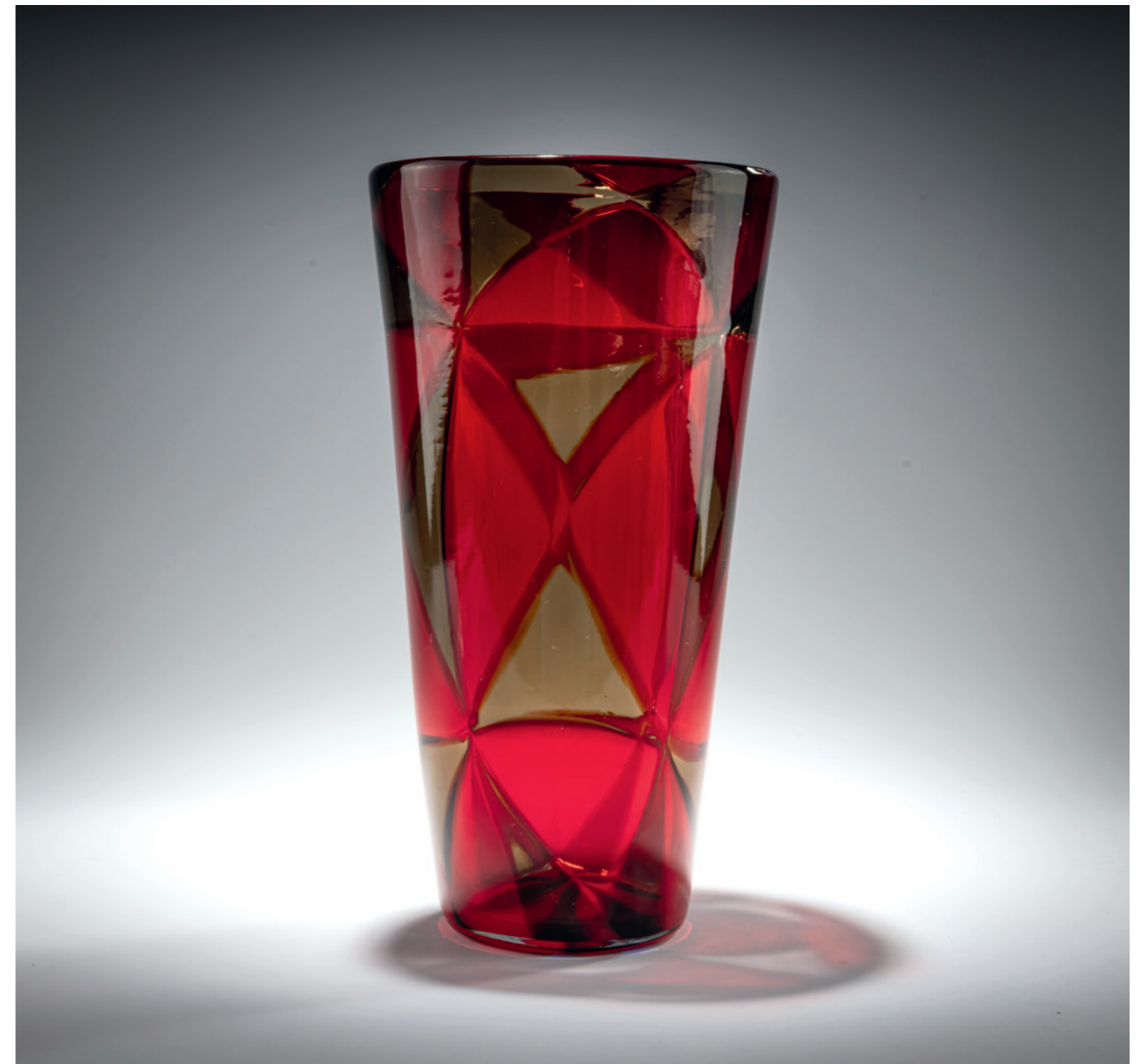
619 Ercole Barovier Vase 'Intarsio', 1961-1963

H. 30 cm. Execution: Barovier & Toso. Colorless glass with fused triangular platelets in gray and red.