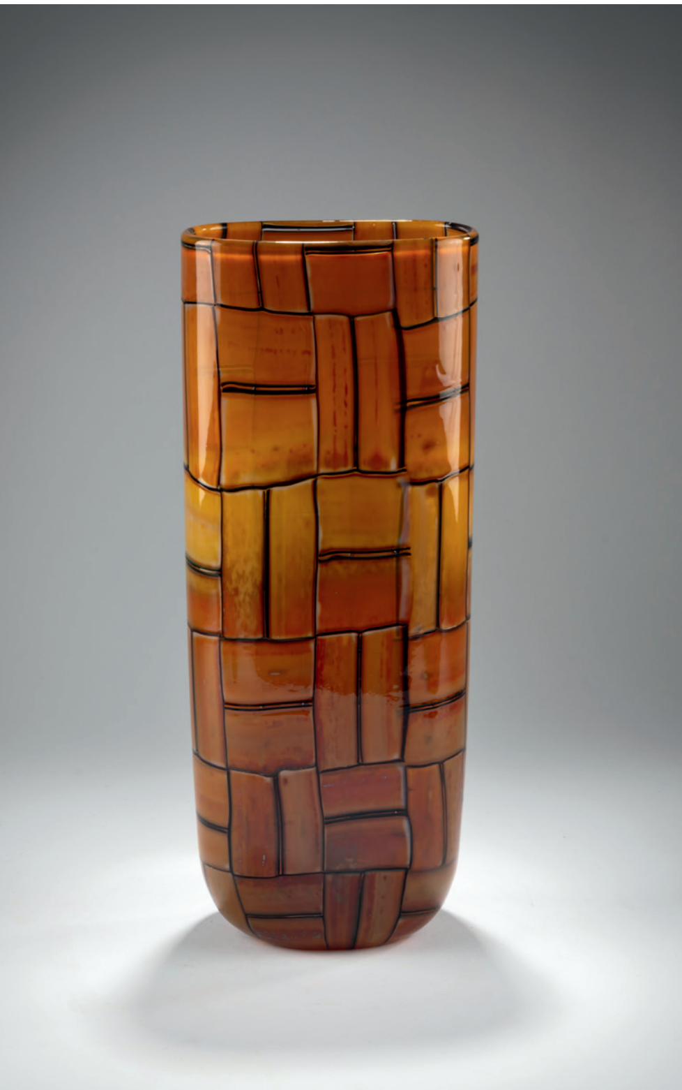
616 Ercole Barovier Tall Vase 'Tessere ambra', 1957

H. 40.5 cm. Execution: Barovier & Toso. Offset, fused glass platelets in opal white and amber brown with a violet rim. Bottom marked: barovier & toso murano (engraved), original manufacturer's label.