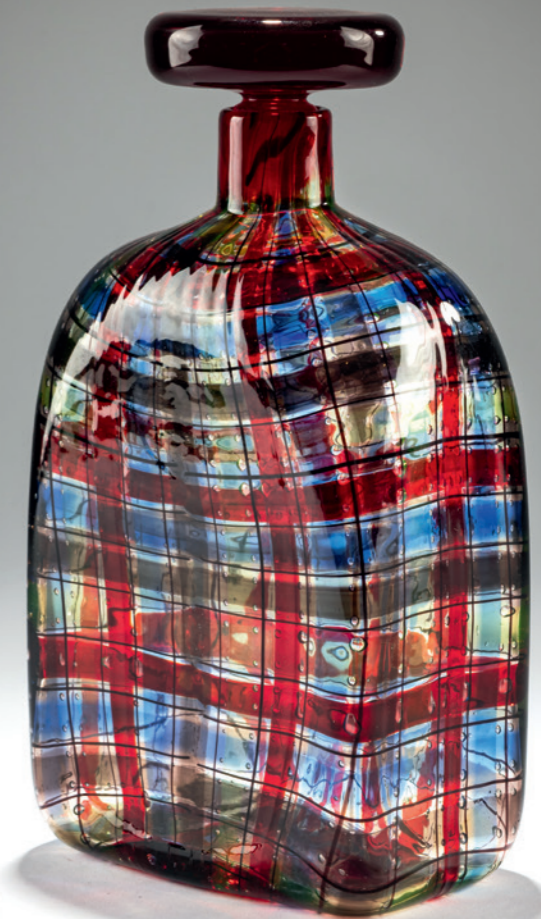
627 Ercole Barovier Bottle with stopper 'Dior', c. 1969

H. 22.6 cm. Execution: Barovier & Toso. Colorless glass with an inlaid 'Scozzese' net pattern of blue, red, and pale yellow bands with dark violet threads and regularly pricked air bubbles; red stopper.