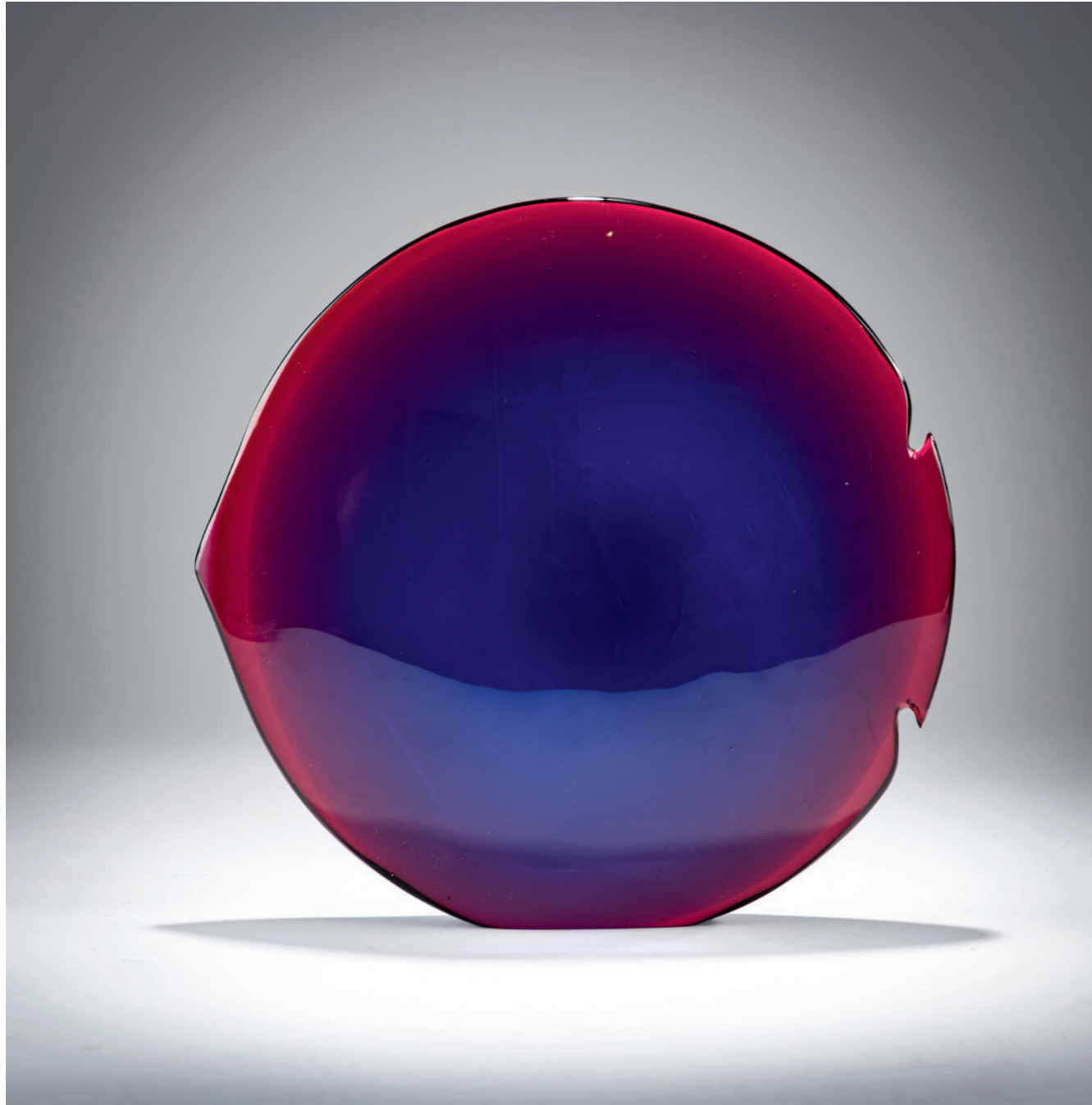
641 Flavio Poli Fish 'Sommerso blu rubino', 1954/55

Model No. 9813, for the X. Triennale, Milan 1954. H. 23.5 cm. Execution: Seguso s.r.l. Overlaid glass, clear, pink and dark blue. Bottom marked: Veronese Seguso Murano (engraved). .)