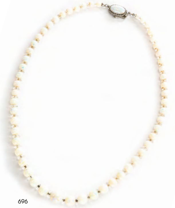
696 Opal collier Platinum, opal beads, rock crystal. 23.19 grams. L. 420 mm. Marked: PLATIN HANDARBEIT (embossed). € 1.400 - 1.800