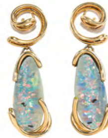
697 Trudel, Zurich Pair of Opal Earrings 18K yellow and white gold, opal matrix. 7.55-8.46 grams each. H. 44 x 15 mm. Marked: TRUDEL, 750 (embossed). € 1.000 - 1.200