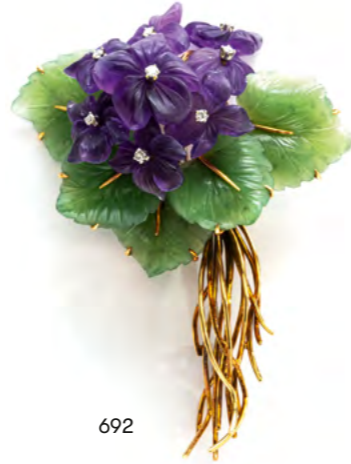
692 Flower brooch 18K yellow gold, carved nephrite leaves, amethyst flowers with diamond trim. 34.00 grams. H. 78 x 59 mm. Marked: 750, workshop mark (embossed). € 1.400 - 1.600